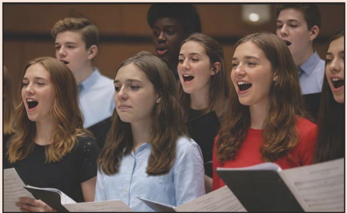
The Importance of the Voice : pages 42-54