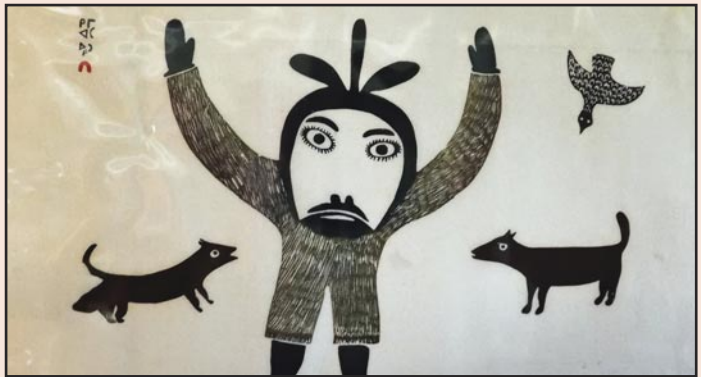
Shamanism in Greenland : pages 38-47

THE FOUNDING INSPIRATION FOR SACRED HOOP MAGAZINE IN 1993 "Then I was standing on the highest mountain of them all, and around and about me was the whole hoop of the world... I was seeing in a sacred manner the shapes of all things in the spirit and the shapes of all shapes as they must live together like one being. And I saw that the Sacred Hoop of my people was one of many hoops that made one circle, wide as daylight and as starlight and in the centre grew one almighty flowering tree to shelter all the children of one Mother and one Father, and I saw that it was holy." (From the vision of Nicholas Black Elk Lakota Holy Man: 1863 - 1950)