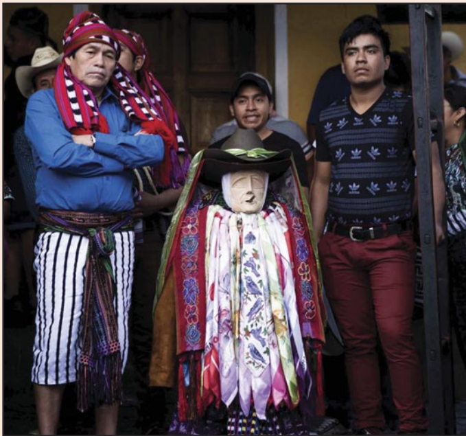
Sacred Festivals in Guatamala : pages 18-24