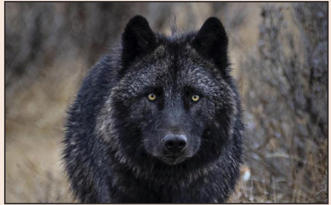
The Sacred Language of Nature : pages 25-29