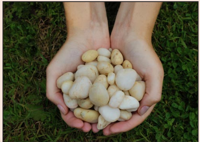
White Quartz, Stone of the Ancestors : pages 30-33