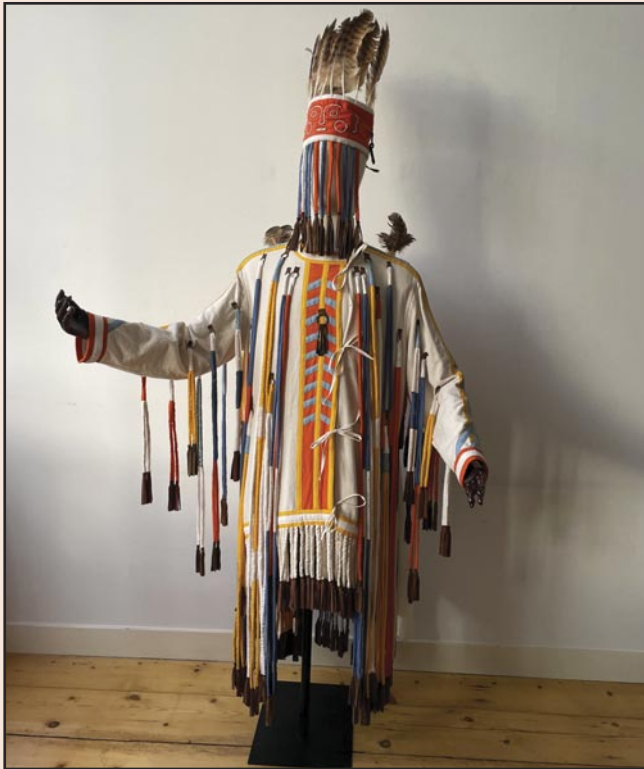
Shamanic Armour - Ritual Costumes : pages 6-17