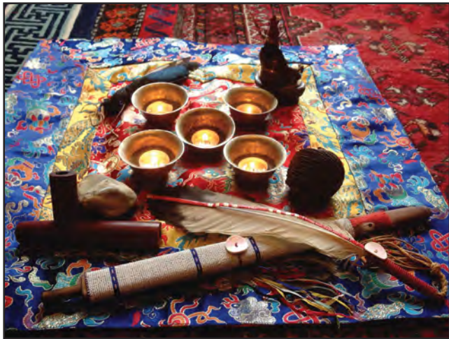
Creating Sacred Space : pages 34-39