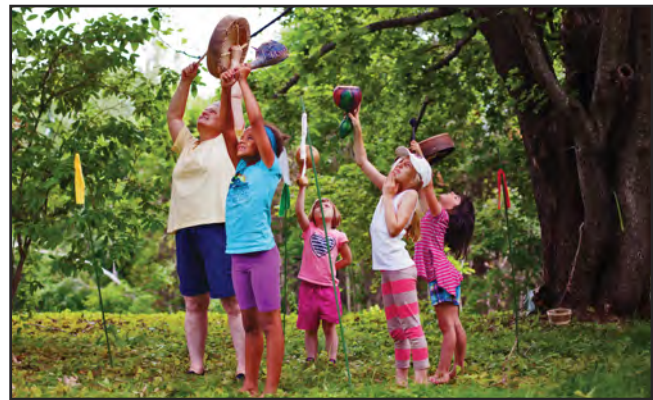
Working with Children : pages 44-45