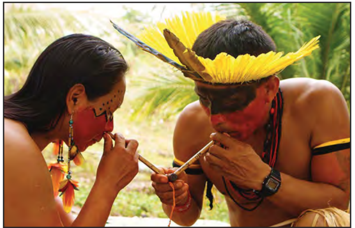
Amazonian Tobacco Snuff : pages 31-33

THE FOUNDING INSPIRATION FOR SACRED HOOP MAGAZINE IN 1993 "Then I was standing on the highest mountain of them all, and around and about me was the whole hoop of the world... I was seeing in a sacred manner the shapes of all things in the spirit and the shapes of all shapes as they must live together like one being. And I saw that the Sacred Hoop of my people was one of many hoops that made one circle, wide as daylight and as starlight and in the centre grew one almighty flowering tree to shelter all the children of one mother and one father, and I saw that it was holy." (From the vision of Nicholas Black Elk Lakota Holy Man: 1863 - 1950)