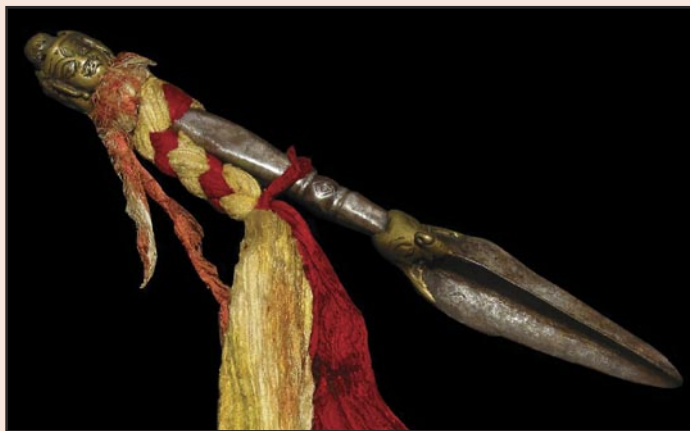
Phurba - Sacred Demon Dagger : pages 48-54