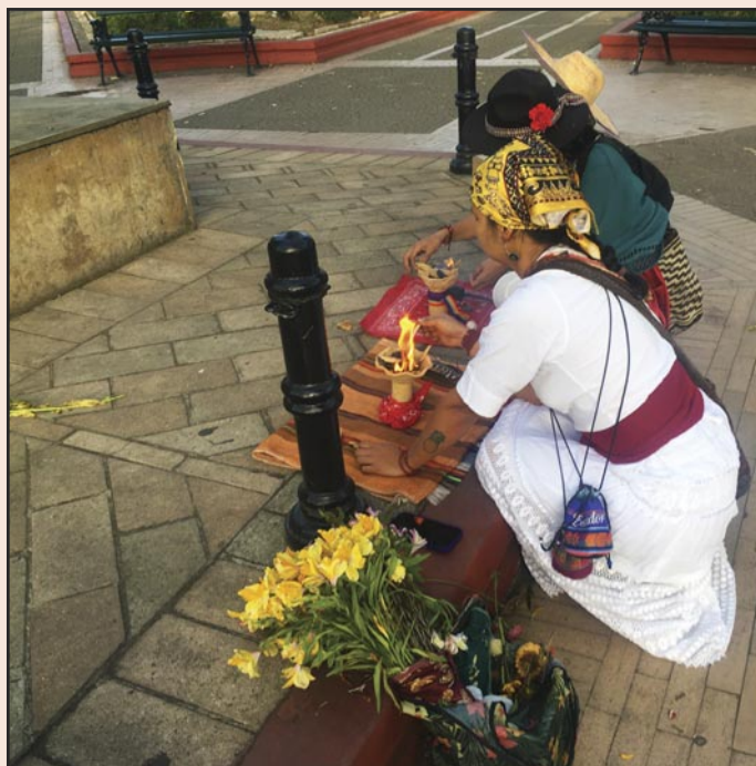
Reclaiming The Sacred in Modern Colombia : pages 14-19