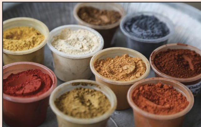
Sacred Language, Colour From the Earth : pages 25-35