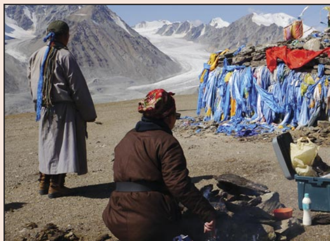
Great Depth of Traditional Shamanism : pages 6-13