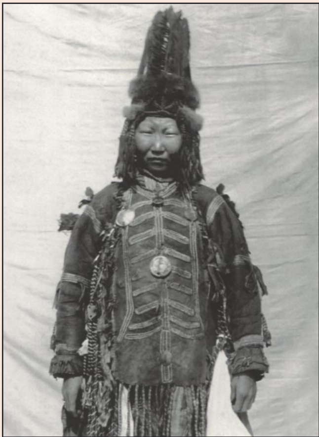
Shamanic Healing in Southern Siberia : pages 36-43