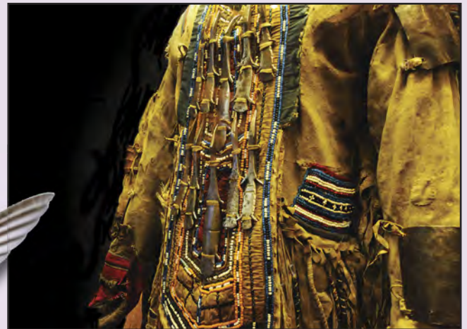
Siberian Shamanistic Apron Armour : pages 42-45