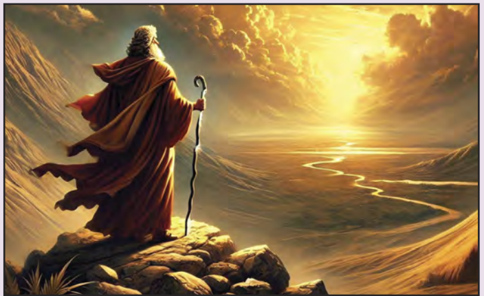
The Spirits of the Jewish Dead : pages 34-41