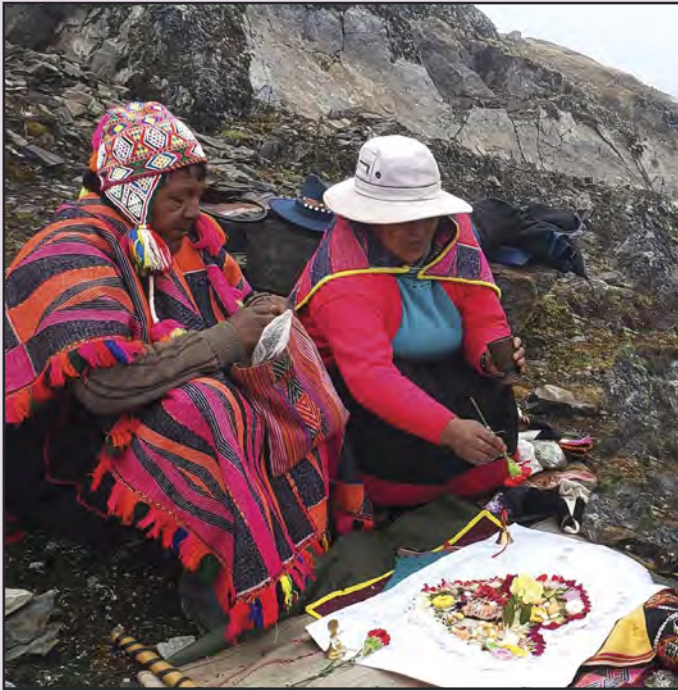
Sacred Traditions of the Andes : pages 6-28