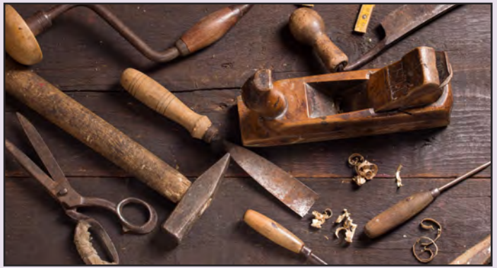
The Art of Sacred Craftwork : pages 48-51