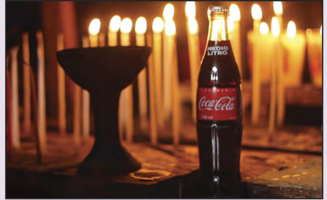
Coca-Cola, Christ and Curanderos : pages 28-33