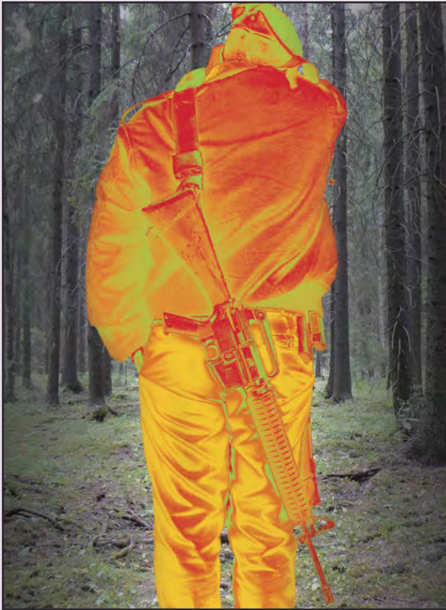
Healing PTSD in a Soldier : pages 46-50