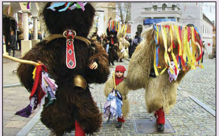
Whisperings of the Wild Spirits of Nature : pages 44-47