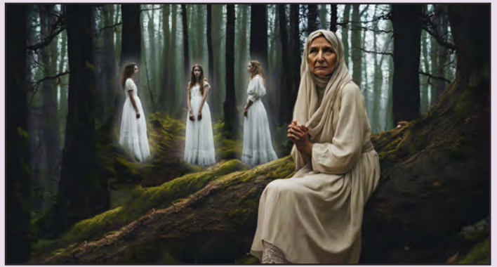
Working with the Fairies in Serbia : pages 48-51

THE FOUNDING INSPIRATION FOR SACRED HOOP MAGAZINE IN 1993 "Then I was standing on the highest mountain of them all, and around and about me was the whole hoop of the world... I was seeing in a sacred manner the shapes of all things in the spirit and the shapes of all shapes as they must live together like one being. And I saw that the Sacred Hoop of my people was one of many hoops that made one circle, wide as daylight and as starlight and in the centre grew one almighty flowering tree to shelter all the children of one Mother and one Father, and I saw that it was holy." (From the vision of Nicholas Black Elk Lakota Holy Man: 1863 - 1950)