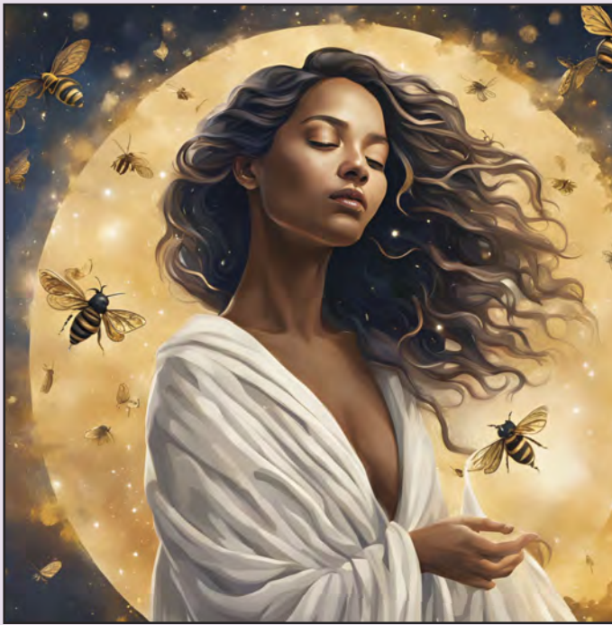
The Sacred Trust and fake 'Bee Shamanism' : pages 6-20