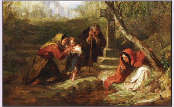
The Mystery of Ireland's Healing Wells : pages 36-37