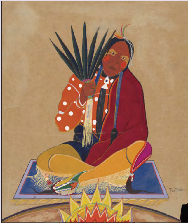
The Native American Peyote Road : pages 52-55