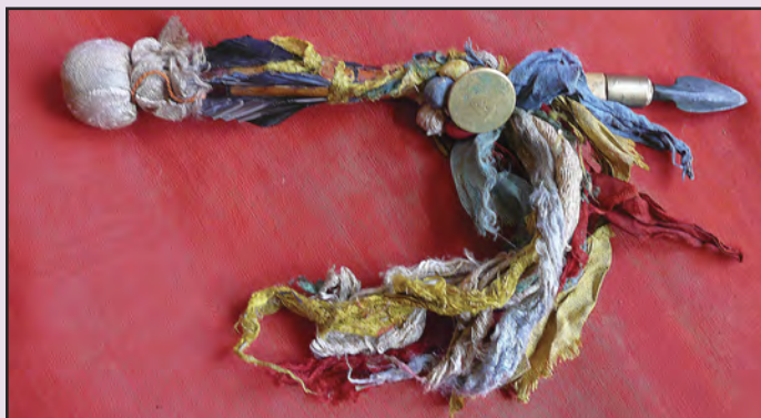
Working with Magical Arrows : pages 28-40

THE FOUNDING INSPIRATION FOR SACRED HOOP MAGAZINE IN 1993 “Then I was standing on the highest mountain of them all, and around and about me was the whole hoop of the world... I was seeing in a sacred manner the shapes of all things in the spirit and the shapes of all shapes as they must live together like one being. And I saw that the Sacred Hoop of my people was one of many hoops that made one circle, wide as daylight and as starlight and in the centre grew one almighty flowering tree to shelter all the children of one Mother and one Father, and I saw that it was holy.” (From the vision of Nicholas Black Elk Lakota Holy Man: 1863 - 1950)