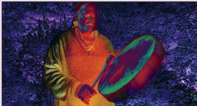
Hoing Deeper in Shamanic Practice : pages 44-49