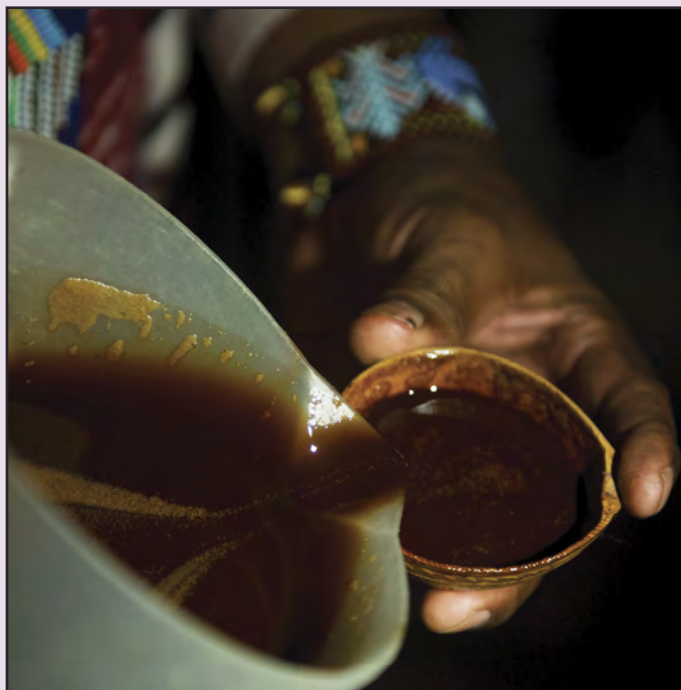
The Corrupting Power of Ayahuasca : pages 6-10