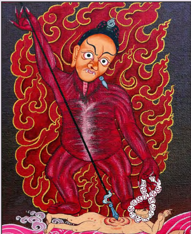
bTsem Spirits of the Himalayas : pages 22-27