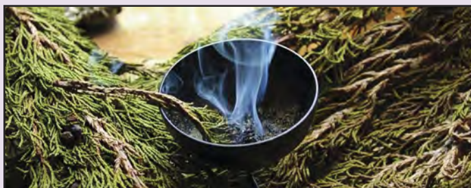
Deepening Our Shamanic practice : pages 44-49