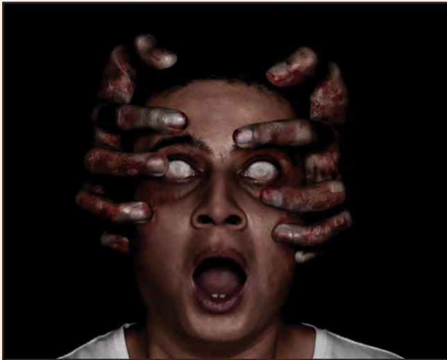
Spirit Possession and Exorcism : pages 42-47