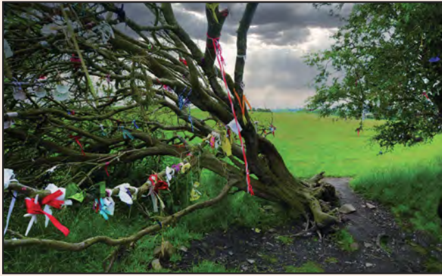
Celtic Wisdom from Ireland : pages 34-41