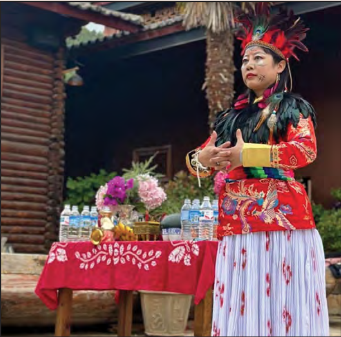
Shamanic Help for a lake in Southern China : pages 18-25