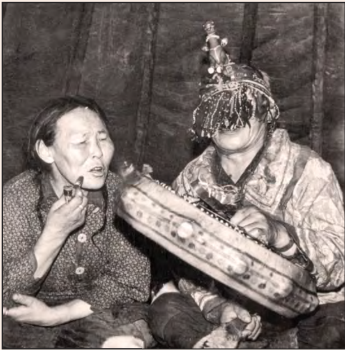
Nganasan Shamanism in Northern Siberia : pages 6-15