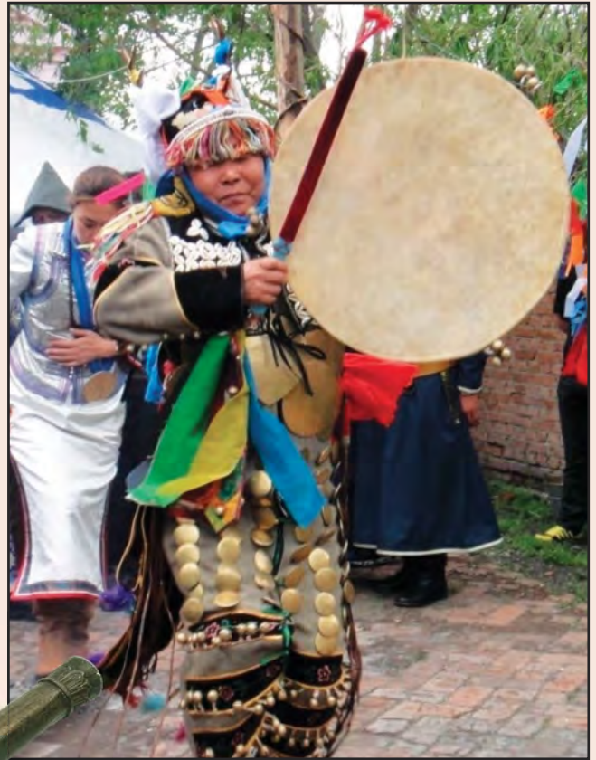
Daur Mongol Shamanism in China : pages 22-28