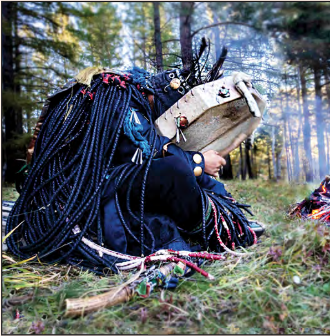
Shamanism and Environmental Activism : pages 6-21