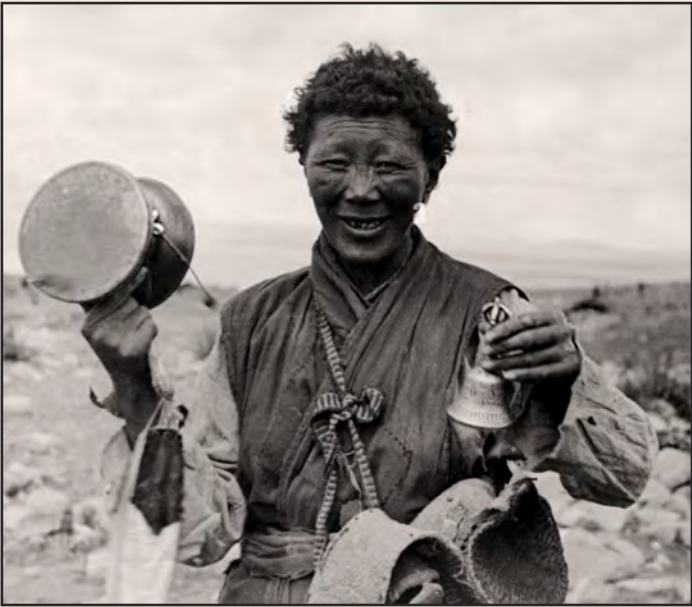
Tales of Madness and Demons in Tibetan Chöd : pages 38-47

THE FOUNDING INSPIRATION FOR SACRED HOOP MAGAZINE IN 1993 "Then I was standing on the highest mountain of them all, and around and about me was the whole hoop of the world... I was seeing in a sacred manner the shapes of all things in the spirit and the shapes of all shapes as they must live together like one being. And I saw that the Sacred Hoop of my people was one of many hoops that made one circle, wide as daylight and as starlight and in the centre grew one almighty flowering tree to shelter all the children of one Mother and one Father, and I saw that it was holy." (From the vision of Nicholas Black Elk Lakota Holy Man: 1863 - 1950)