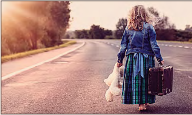
A Life-long Love of Bags : pages 36-37