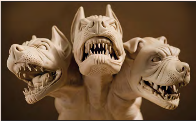
Spirit Dogs : pages 48-50