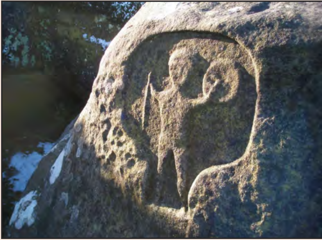
Seeking Ancient British Animism : pages 21-25