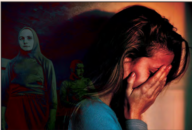
Disturbing Thought Forms and Mental Illness : pages 44-48