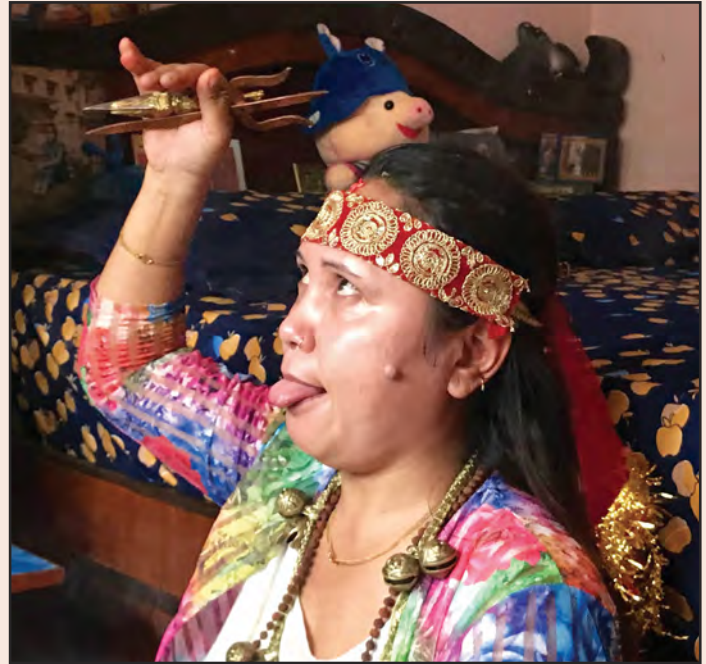
Spirit Possession in Nepal : pages 6-15