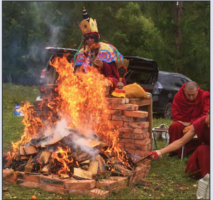
Shamans, Lamas and Travels in Mongolia : pages 24-31

THE FOUNDING INSPIRATION FOR SACRED HOOP MAGAZINE IN 1993 "Then I was standing on the highest mountain of them all, and around and about me was the whole hoop of the world... I was seeing in a sacred manner the shapes of all things in the spirit and the shapes of all shapes as they must live together like one being. And I saw that the Sacred Hoop of my people was one of many hoops that made one circle, wide as daylight and as starlight and in the centre grew one almighty flowering tree to shelter all the children of one Mother and one Father, and I saw that it was holy." (From the vision of Nicholas Black Elk Lakota Holy Man: 1863 - 1950)