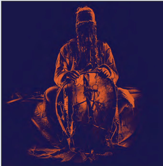
Shaman wars and shaman Curses : pages 13-18