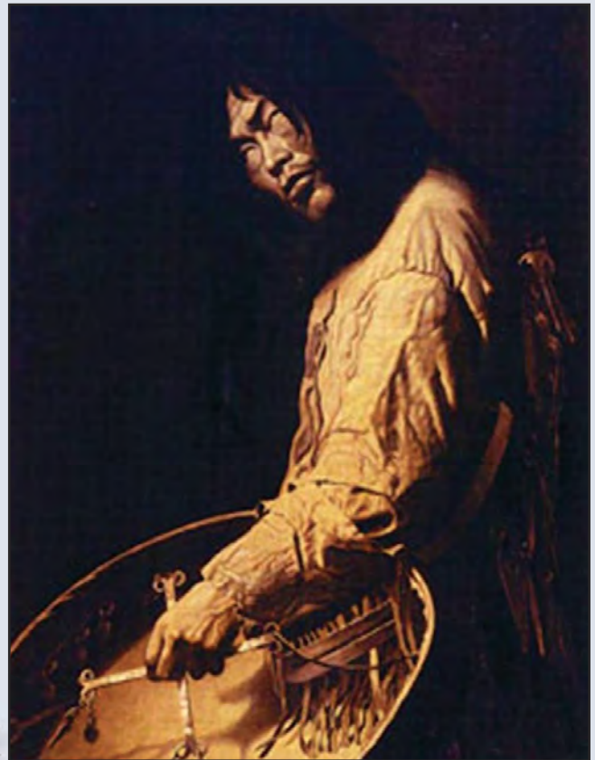
Traditional and Core Shamanic Spirits : pages 6-12