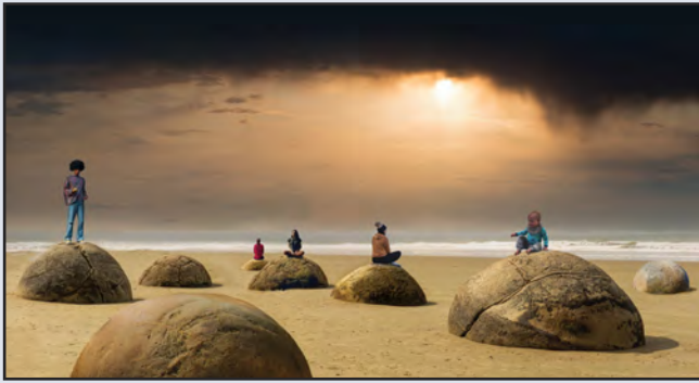
Psychopomp Work and Core Shamanism : pages 40-43