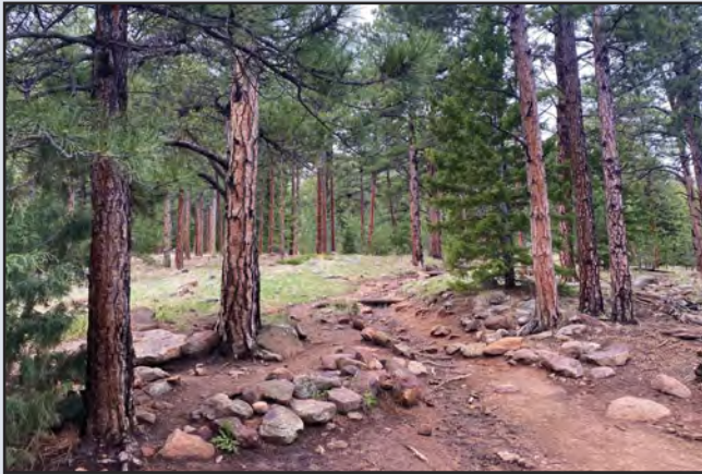
Trees and the Spirit of the Ponderosa Pine : pages 19-23