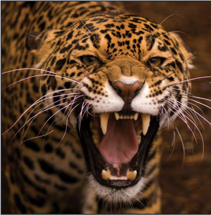
Jaguars, Magic and Warfare : pages 6-14