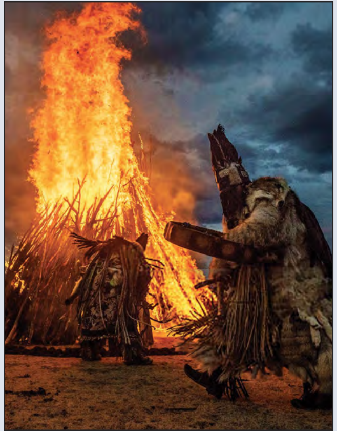
The Spirit of Fire : pages 30-36