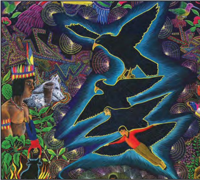
Pablo Amaringo, the Art and legacy : pages 38-47