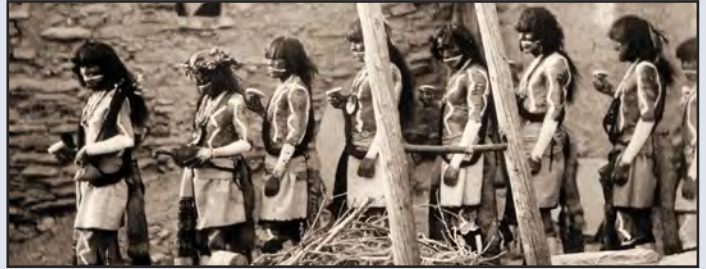
The Hopi Snake Dance : pages 48-55