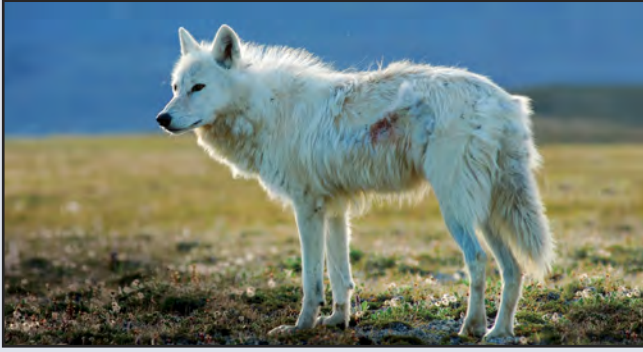
The Howl of the Wolf : pages 15-19