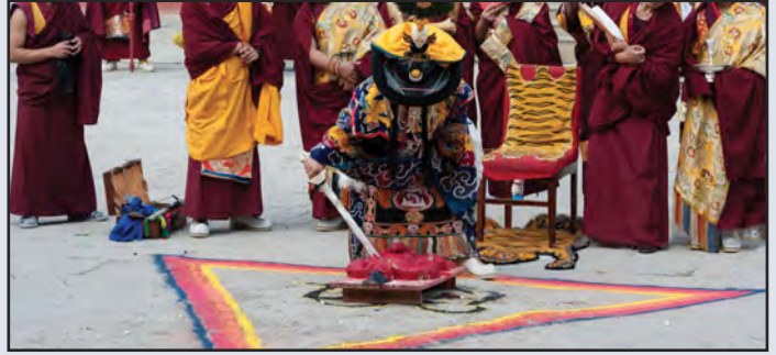
Tibetan Magic and Sorcery : pages 20-29