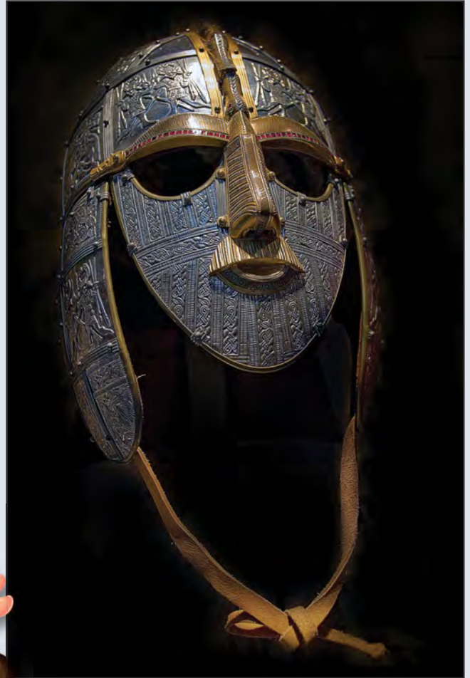
The Anglo Saxon and Norse Sacred World : pages 14-27