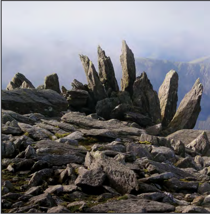
The Earth Lords of the World : pages 28-31