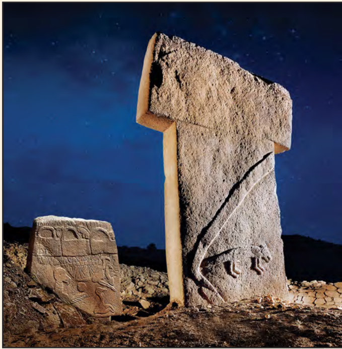
The Sacred Site of Gobekli Tepe : pages 20-26