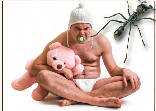
Mens' Rites of Passage : pages 6-14