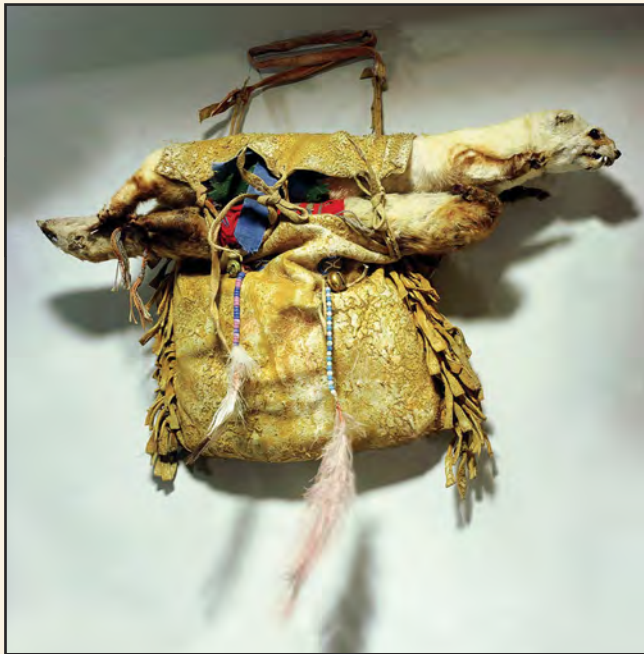
Lakota Medicine Power : pages 27-31