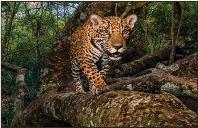
A Quechua Path of Power : pages 34-38

THE FOUNDING INSPIRATION FOR SACRED HOOP MAGAZINE IN 1993 "Then I was standing on the highest mountain of them all, and around and about me was the whole hoop of the world... I was seeing in a sacred manner the shapes of all things in the spirit and the shapes of all shapes as they must live together like one being. And I saw that the Sacred Hoop of my people was one of many hoops that made one circle, wide as daylight and as starlight and in the centre grew one almighty flowering tree to shelter all the children of one Mother and one Father, and I saw that it was holy." (From the vision of Nicholas Black Elk Lakota Holy Man: 1863 - 1950)