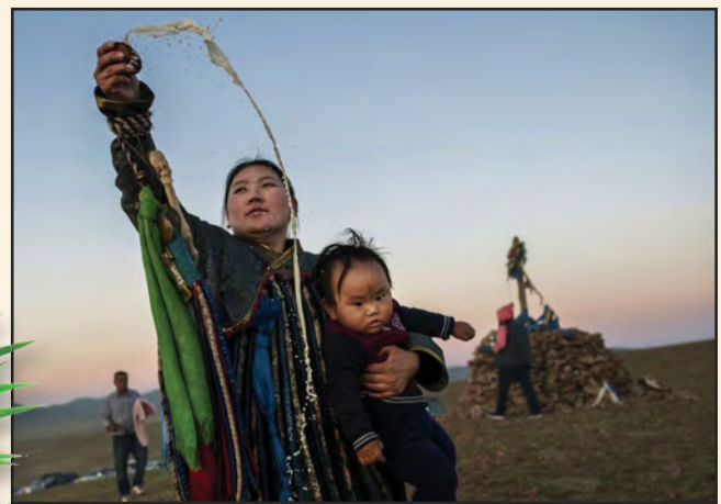
Mongolian Milk Offerings : pages 39-43