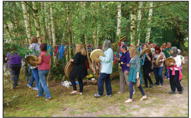
Creating Ceremony : pages 16-23