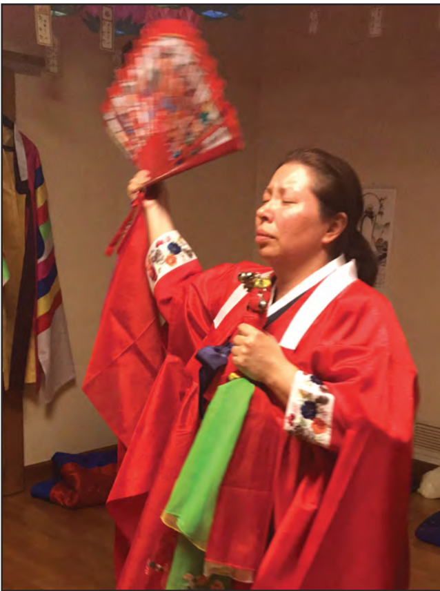
A Korean Shamanic Kut Ceremony : pages 24-29