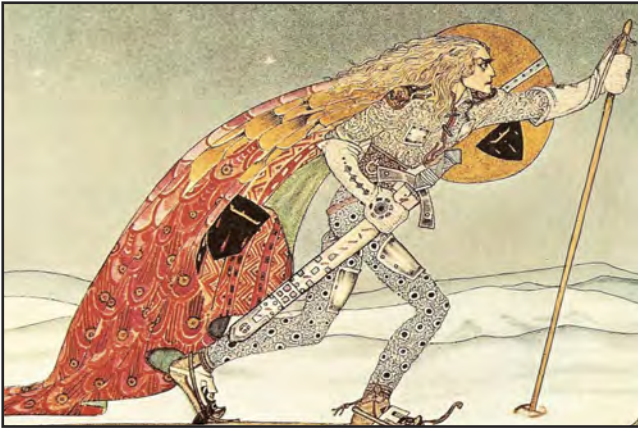
Fairy Tales and the Hero's Quest : pages 36-40