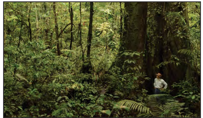
Traditional Medicine in the Amazon : pages 30-35