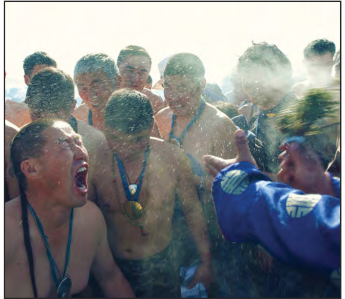
Shaman's Holy Water : pages 41-43