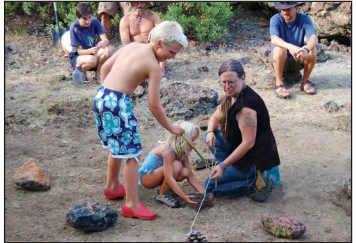
Building a Stone Medicine Wheel : pages 48-49