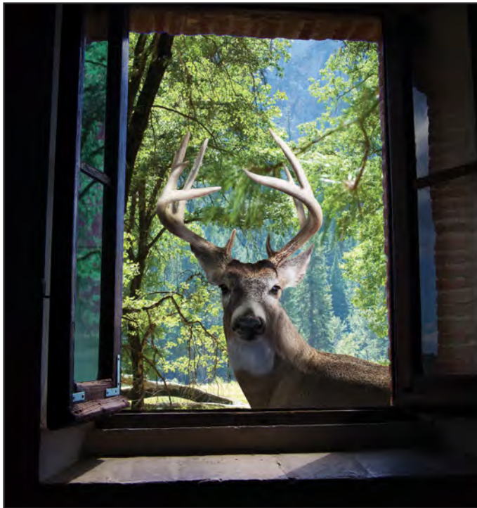
Spirits Manifesting : pages 40-44