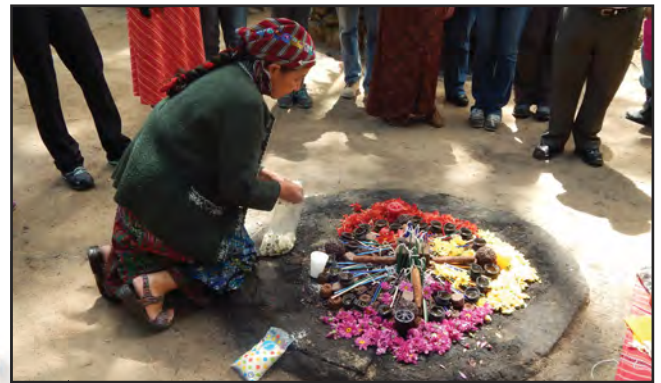
Mayan Ways to Balance : pages 24-29