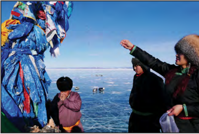
Shamanism in the North of Mongolia : pages 6-13