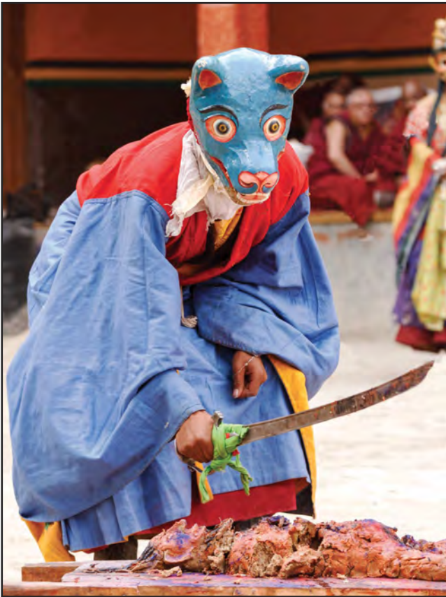
The Ritual Use of Dolls and Effigies : pages 30-37