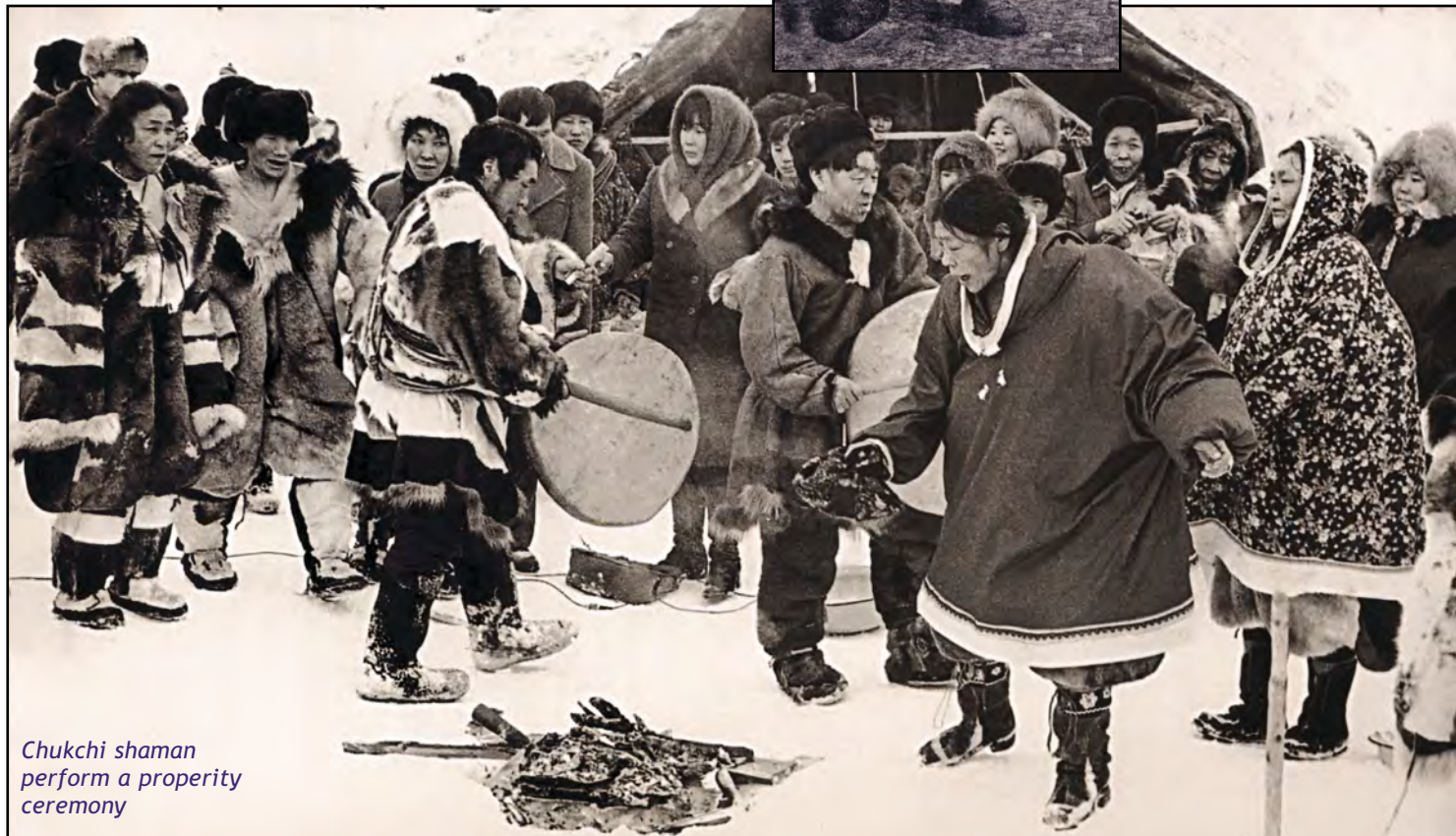
Chukchi shaman perform a prosperity ceremony