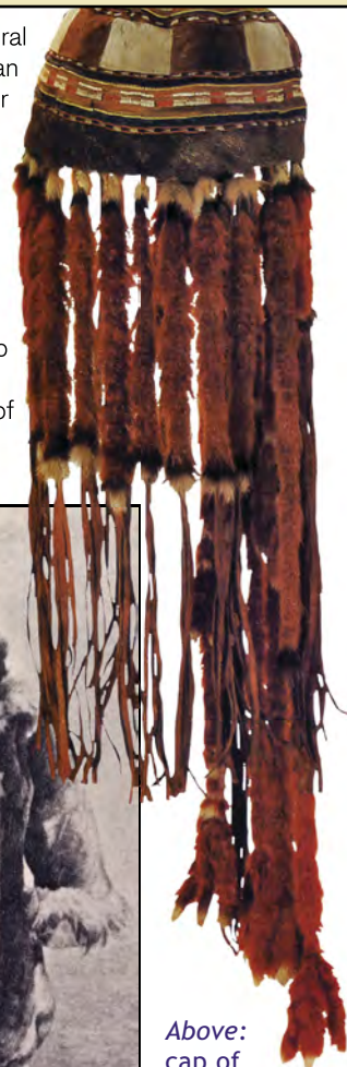
Above: cap of a transgender 'transformed' shaman. Yukaghir people