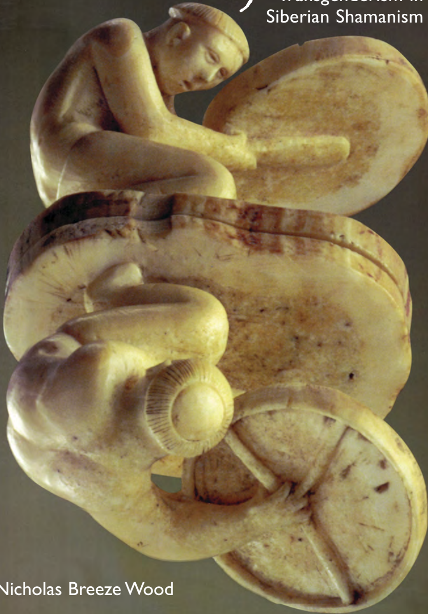
Nicholas Breeze Wood

Above: carved marine ivory statue of a shaman drumming. Koryak people