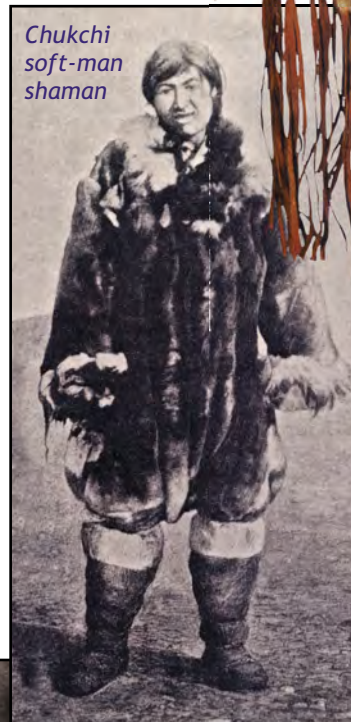
Chukchi soft-man shaman

One Chukchi shaman recounts how when he was young before becoming a shaman, he was afflicted with a strange illness. Eventually a spirit appeared to him and ordered him to put on a woman's dress, after which he got better and became a shaman