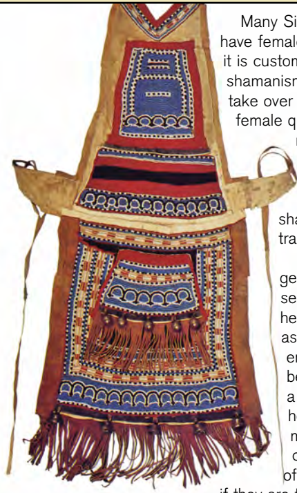
Above: woman's decorative chest panel. Evenki people