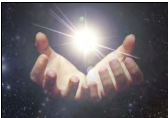
Shaman from the stars - pages 38-39