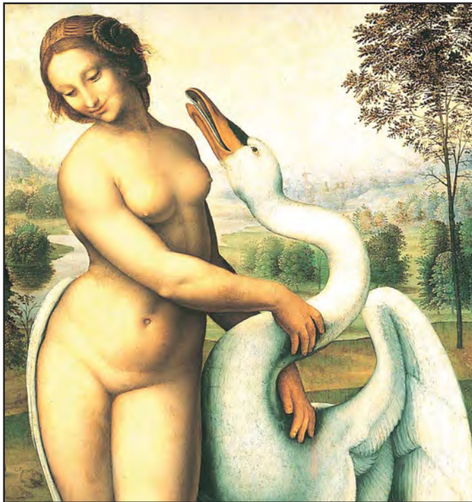
Shamanism and the Spirit Mate : pages 43-45