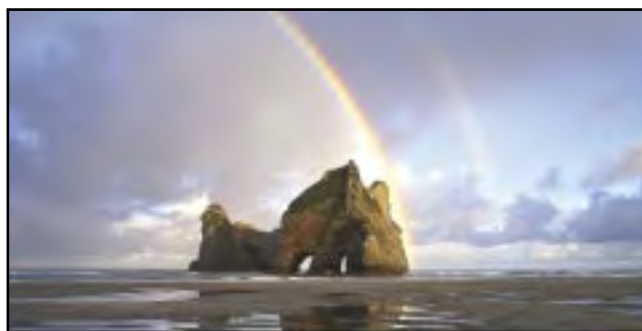
Shamanic cosmologies - pages 11-15