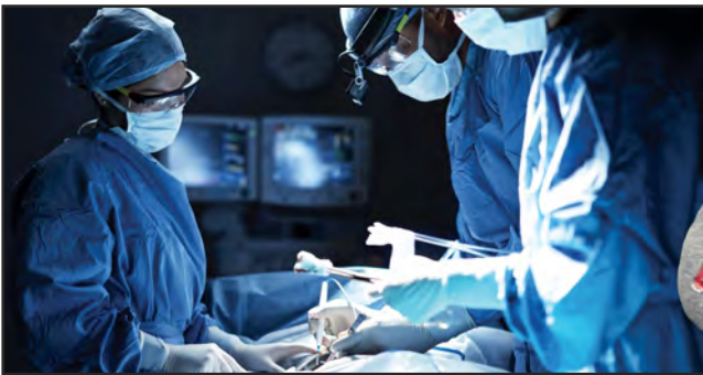
Shamanism and Surgery : pages 6-14