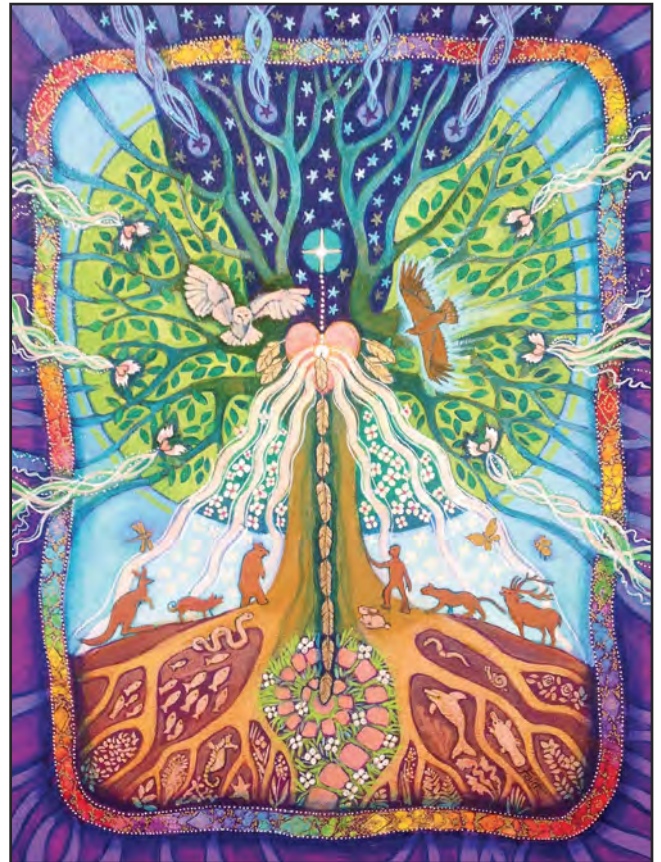
Shamanism and Art : pages 15-21