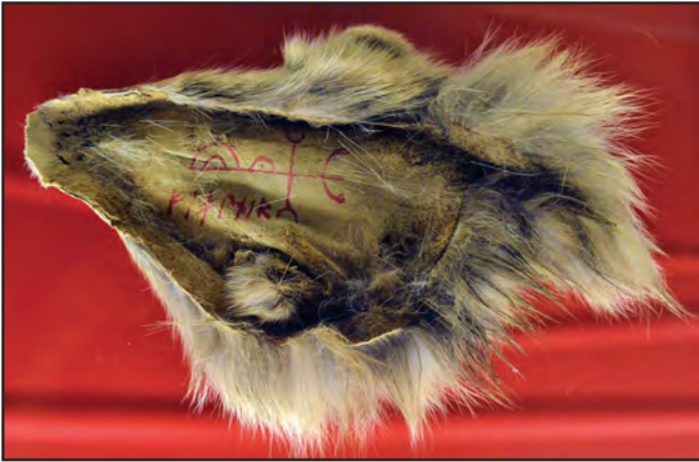
The Sorcery of Iceland : pages 36-42