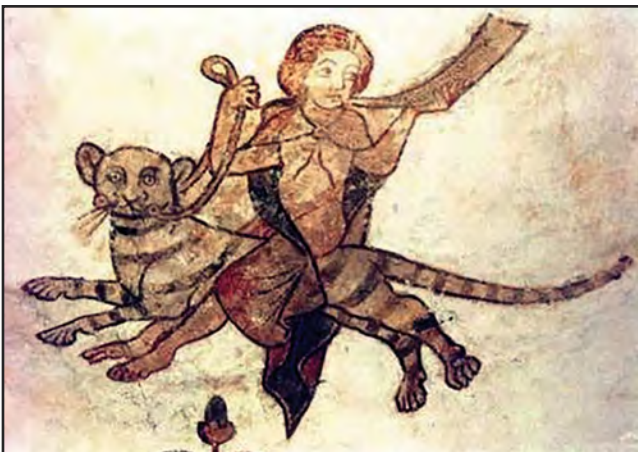
In Search of the Goddess Freyja : pages 22-31