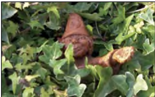
Working with the gnome nation - pages 22-26