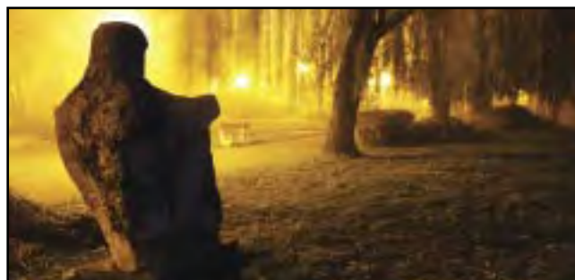
Seeing the hidden realms - pages 18-21