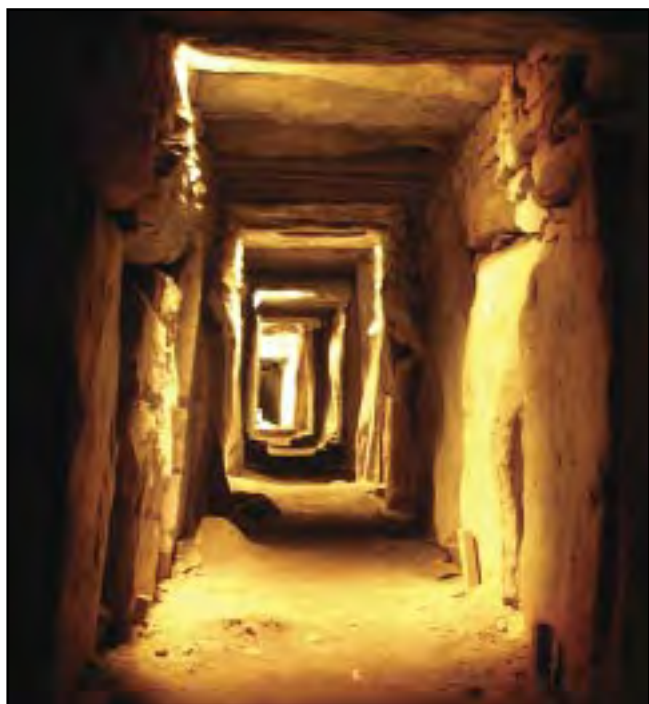
Walking the path of the Dead - pages 27-29