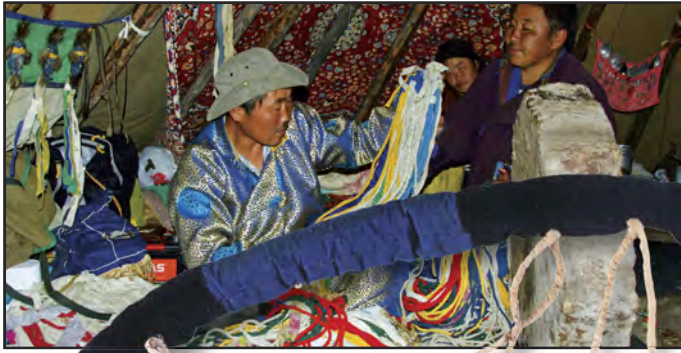
Ceremony for the Moon : pages 6-15