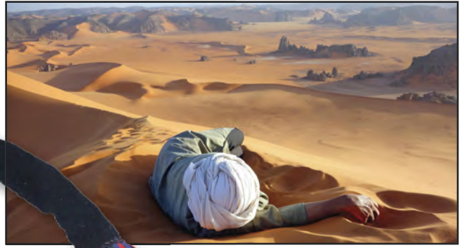
Desert Tuareg : pages 16-27