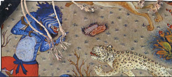
An Encounter with a Djinn Spirit : pages 28-31