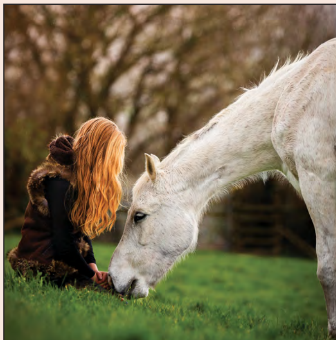
Working with the Spirit of the Horse Goddess : pages 13-17