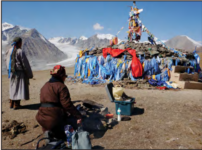
Travel and Ceremony in Mongolia : pages 30-37