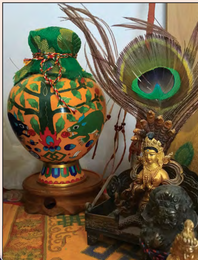
Making Offerings to the Nagas : pages 42-46