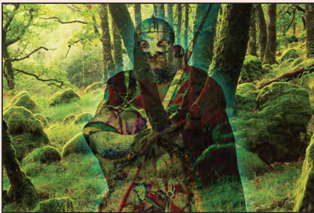
Dark Age tales from Wales : pages 18-24