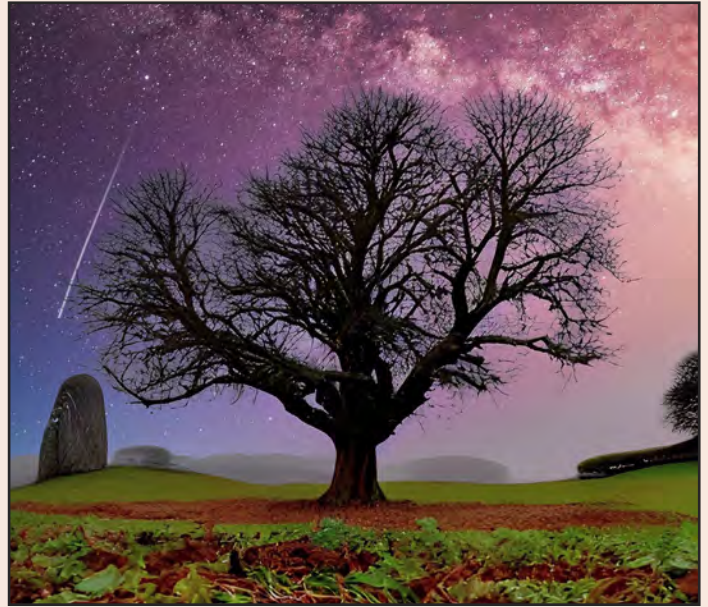
Spirits of Places and Houses : pages 38-41

(From the vision of Nicholas Black Elk Lakota Holy Man: 1863 - 1950)