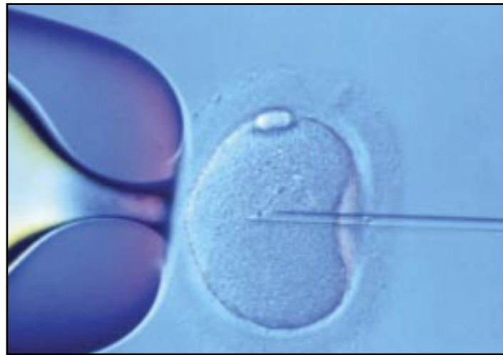
Above: ICSI (Intracytoplasmic Sperm Injection) is a form IVF that involves the direct injection of a single sperm into an egg

She co-founded Divine Women Workshops with Sally Randell to promote ancient healing arts in an easy accessible and relevant way, weaving the pragmatic with the poetic.