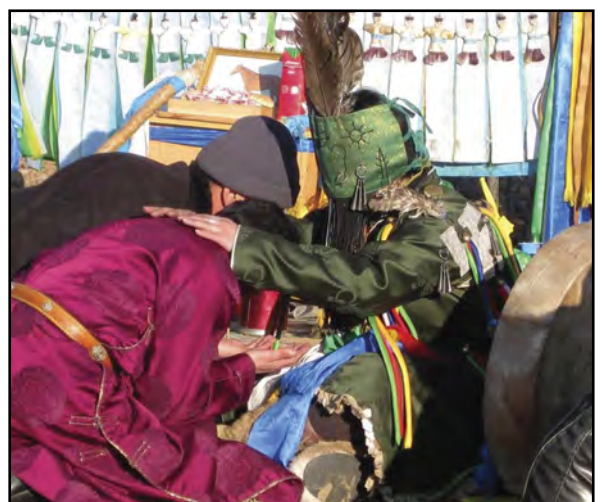
Below: a Mongolian shaman performing a blessing