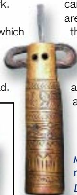
Many jaw harps have special cases made for them to keep them safe. Left: a jaw harp from Nepal, with its brass case