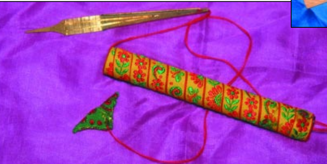
Top: highly decorated brass Morsing jaw harp from India