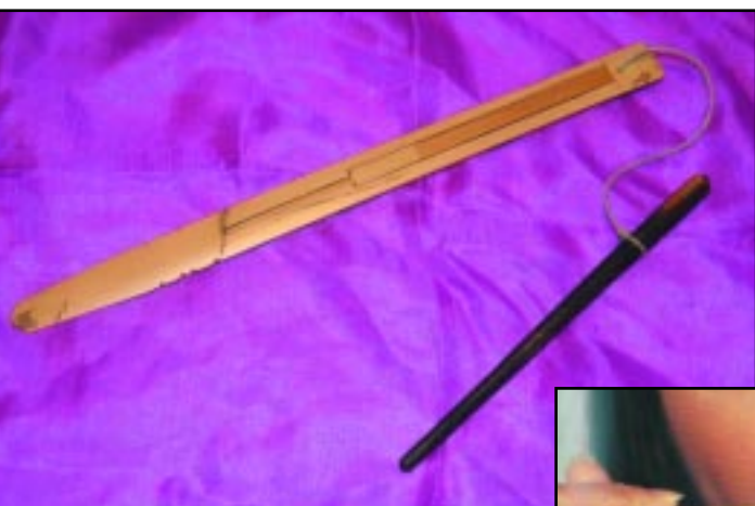
Below: A bamboo GengGong jaw harp from Laos

The host handed over his instrument, and the guest began to