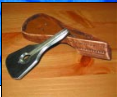
Inset above: a modern Russian khomus in the shape of a guitar